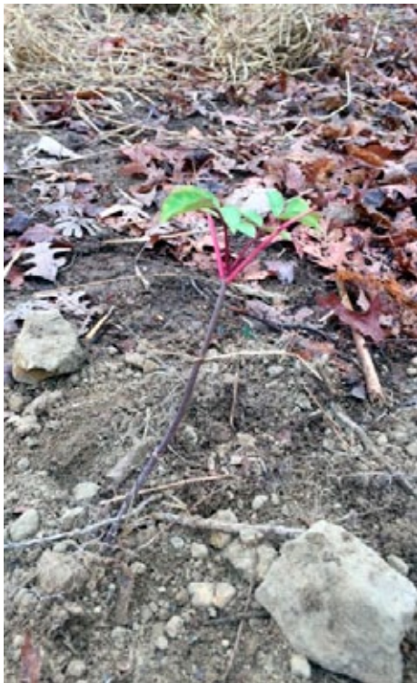
Elderberry ( Sambucus canadensis ) seedling hand-planted by volunteers at a planting site.