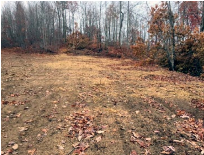
One of several log landing planting sites.

The grouse program and northeast region thank the volunteers and staff for their help!