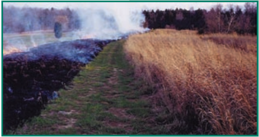
Figure 2. Prescribed burning is an economical and beneficial alternative to mowing.

Fields dominated by broadleaf plants and old field areas that have grown up in woody plants should also be mowed during late winter (February) or early fall (September) to main-