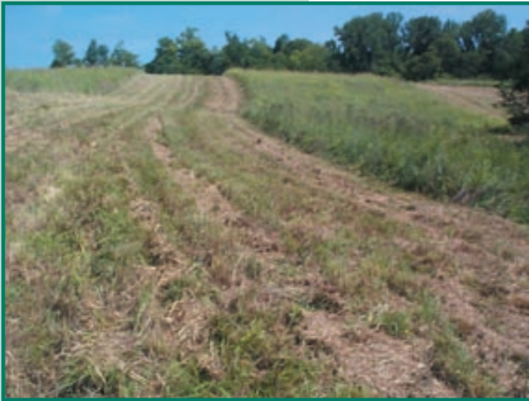
Figure 3. A field managed with strip mowing.

The best mowing patterns for wildlife habitat enhancement are strip mowing and random pattern mowing.