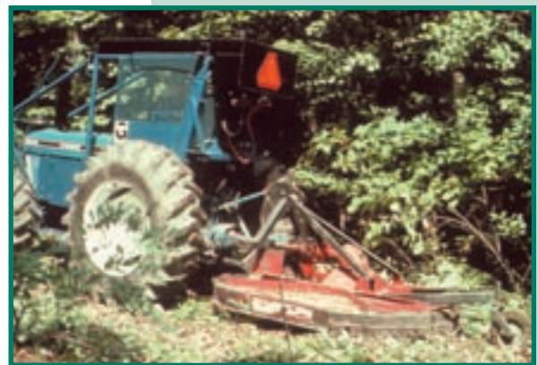
Figure 5. Brush hogging is a common mowing technique.

Consider using prescribed burning (controlled fire) to manage your fields instead of mowing; it is cost effective, stimulates grasses and legumes, and removes leaf litter that can stifle productivity and impede animal movement.