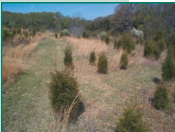
Figure 4. Random pattern mowing creates strips, blocks and islands of cover with different heights.

The best mowing patterns for wildlife habitat enhancement are strip mowing and random pattern mowing.