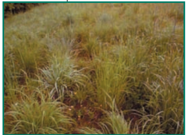
Figure 1. Native grasses managed with prescribed burning (above) compared to tall fescue managed with mowing (below). In the burned stand above, note the open spaces at ground level where small animals can move unhindered.