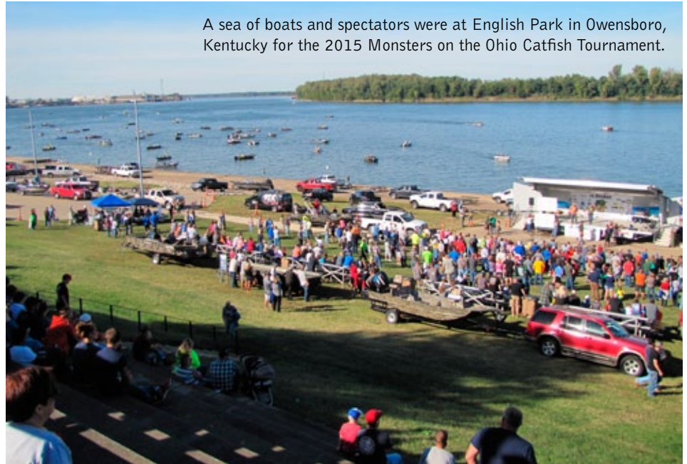
A sea of boats and spectators were at English Park in Owensboro, Kentucky for the 2015 Monsters on the Ohio Catfish Tournament.

Monsters on the Ohio was the culminating tournament for 2015. Tourna-