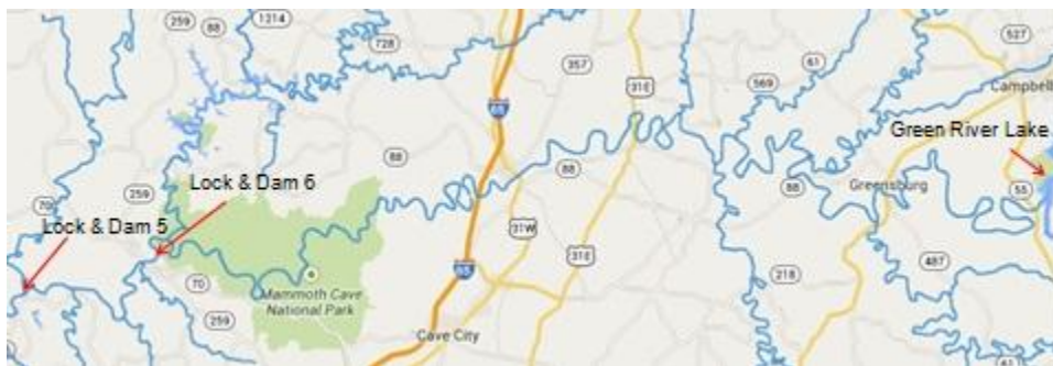
Figure 1. Green River sauger stocking area from Green River Lake to Lock & Dam 5 from 2010-2014.