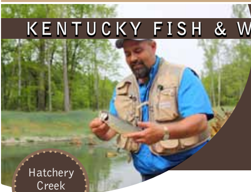
Hatchery Creek Page 5