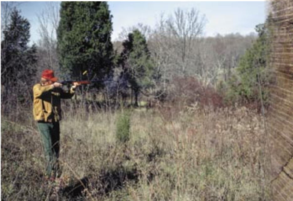
Clean miss, get him with second shot.

Normally, quail get all the water they need from morning dew or small watering holes. In extremely dry weather, hunters could focus on those food plots that have continuous water such as a small creek or pond. As quail are vulnerable to predators when they are in