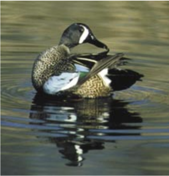
Preening is my favorite time of day.

advancements, but beginners need to start with basics. First, study the waterfowl guide so you know state and federal rules. Recommended hunting equipment will include a 12 gauge shotgun, modified choke, calls (with lots of practice) and good working decoys that are properly strung and weighted.