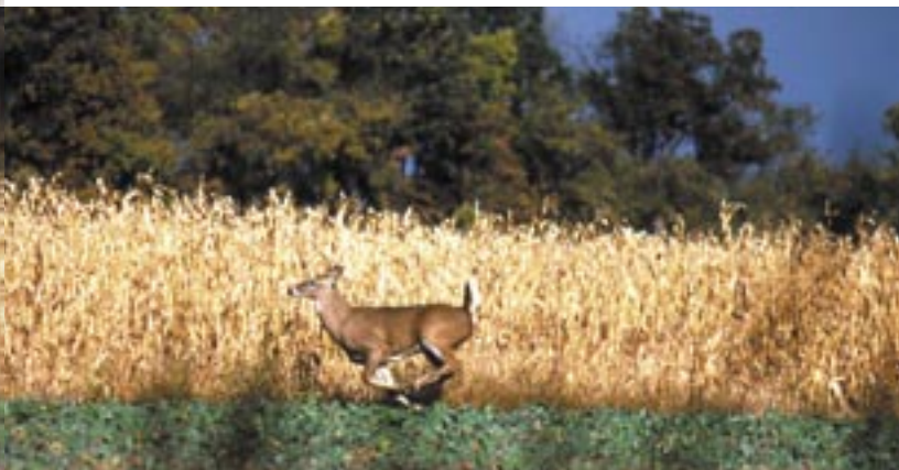
Running deer - a joy to watch but easily missed.