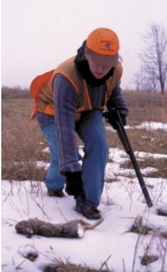
A great choice for the first hunt.

A primary lesson in hunting is to know the zone where it is safe to shoot. Better to watch a rabbit escape without a shot than to explain to a landowner why your shot rattled the side of the barn. When a rabbit is in sight, focus on the total picture rather than the target animal.