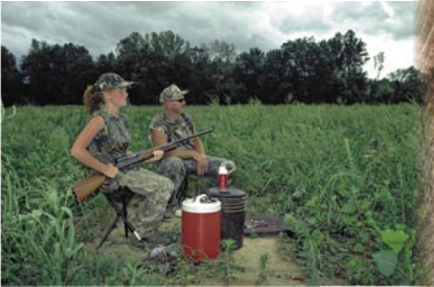
A day in the field with Dad