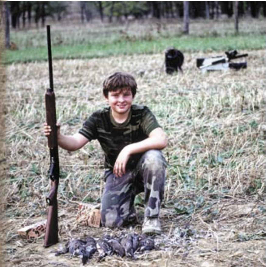
Every one was a high passing shot!

Doves do not need to be cleaned in the field, as their body heat is apparently lost due to the small size of the body. However, if you prefer to pick them, it can be done during a time when doves are not flying. Cutting out the breast or removing entrails is usually done after the shooting is complete and the gun will no longer be handled. If birds are cleaned in the field it is simple courtesy to the landowner to either bury or carry out the feathers and entrails. As with all game, carefully remove all shot before freezing or preparing your doves. To freeze them, use the same technique described in squirrel cleaning.