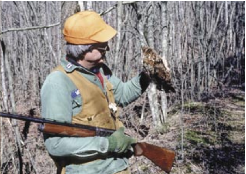
One bird is enough for today.

The best Kentucky grouse habitat is in the hilly, forested regions of Eastern Kentucky. Hunting in this region will require climbing up and down hillsides. Several miles of hiking may be needed to locate birds during a grouse hunt, so make sure you are physically fit. Depending on your age, this often requires regular exercise during the "off" season.