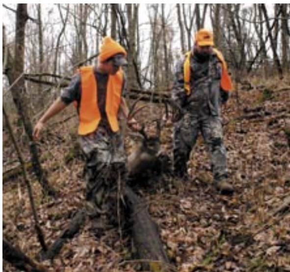
Teamwork in the field

Deer hunters report seeing deer throughout the day. Especially in peak hunting periods, other hunters may move the deer anytime. Therefore, bring plenty of water and enough food to be comfortable. Again remember the senses of deer as you plan for your food, as smells or the sound of tearing a container may alert the deer.