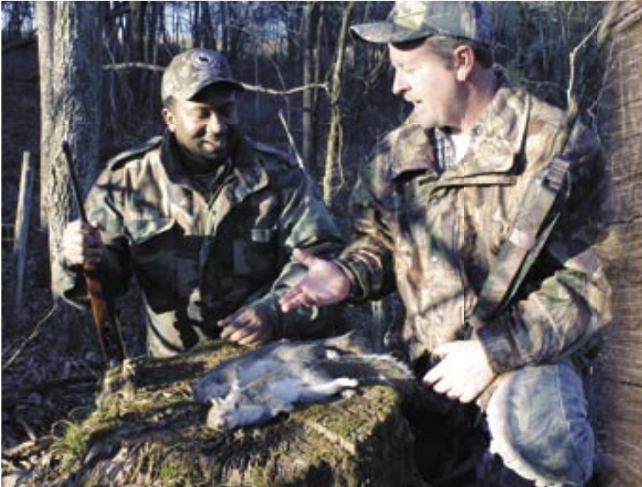
Good friends - a good meal

For those who are reading the printed version of this booklet, we recommend you proceed to your local library. Look for books and magazine articles that focus on hunting specialties that interest you.