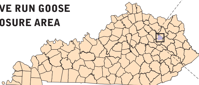
Cave Run Goose Closure Area