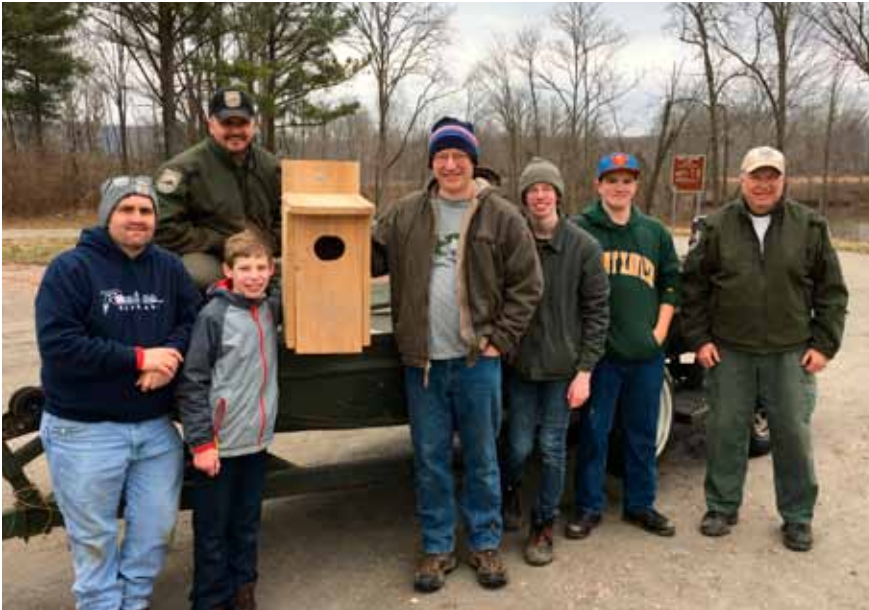
Above: KDFWR staff and BSA Troop 270 members ready to place the wood duck box up. Right: Scouts fill the wood duck boxes with cedar shavings for durable nesting material.