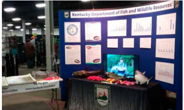
Above: A young angler fights a big Wells Catfish and tests out a new catfish rod on a fishing simulator at the 2019 Catfish Conference. Right: Fisheries Biologists from KDFWR attended the 2019 Catfish Conference to educate the public on recent surveys and answer questions regarding catfish in the Commonwealth.