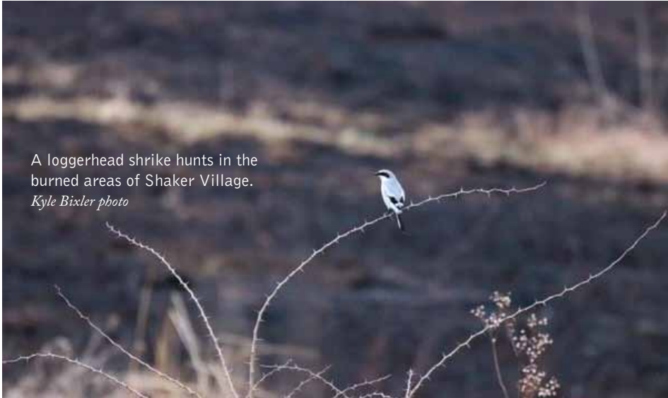
A loggerhead shrike hunts in the burned areas of Shaker Village.