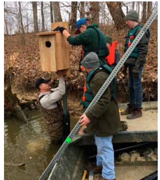
The post is first driven into the lake floor at a selected site, then a predator guard is fastened below the box location, and finally the box is bolted to the post.

ing Eagle) while capitalizing on the volunteer labor, but they also spent some time introducing the biology, ecology and recent history of wood ducks to help put the importance of nesting boxes into perspective. Because of historic losses in wetlands and reduction in availability of large-diameter trees to serve as nesting sites, the species had sharply declined in the early-mid 1900s. However, through research and conservation efforts led by state fish and wildlife agencies, the U.S. Fish & Wildlife Service, and partnering organizations such as Ducks Unlimited, effective strategies were developed in the late 1900s that fostered recovery of the species to sustainable and huntable population levels. To contribute to the ongoing conservation of this species, KDFWR staff and volunteers survey wood duck populations with brood surveys on Kentucky waters; capture,