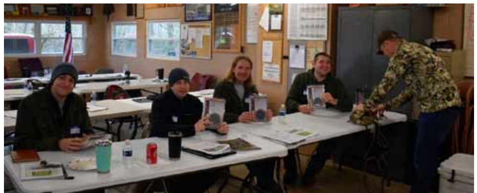
Participants received new Field Proven turkey calls.