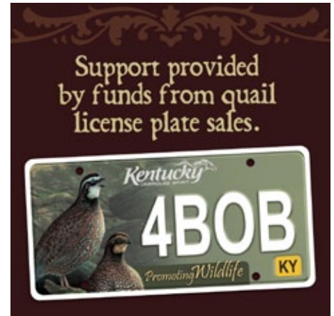
Plate artwork provided by Rick Hill and graphic design by Obie Williams.

Over the last six years, the committee has taken great pride towards funding projects that are visible to the community and carry out the vision established in the Department's bobwhite restoration plan. In 2015 alone, the plate generated over $29,000 in conservation funding. To keep up with the bobwhite license plate projects visit: http://www.kentuckyquailplate.com/ .