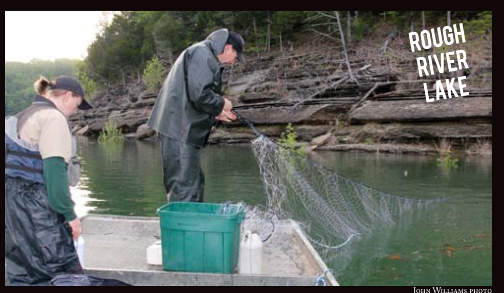
Biologists using gill nets to gauge hybrid striped bass populations found a significant number of 15-20 inch fish in Rough River Lake.

Flooding in the spring can cover shoreline lawns and create some unusual fishing opportunities. "Under flood conditions, there are fish all the way into the submerged yards," Rister said. "That's because there are