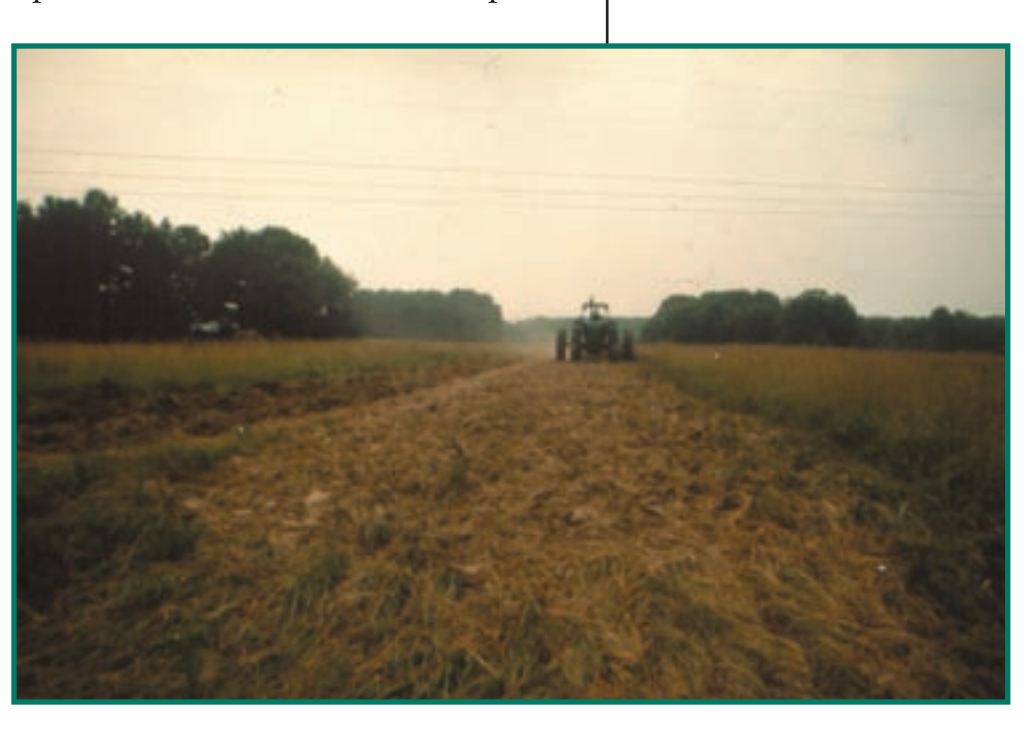
Figure 1. Strip disking creates open spaces in grass stands and stimulates seed producing plants.