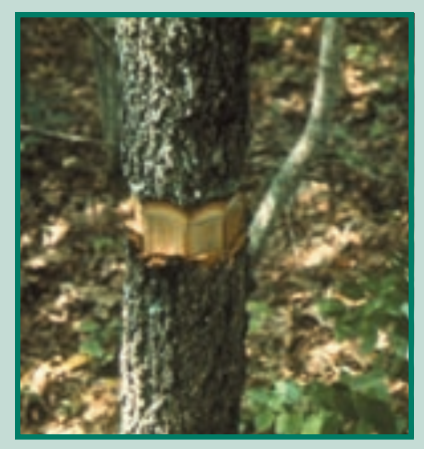
Figure 3. Girdle cutting performed with a hatchet.