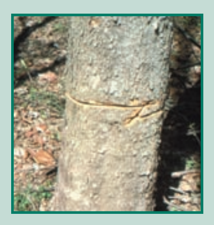
Figure 2. Girdle cutting performed with a chainsaw. Be sure to connect your cut so that it completely rings the cull tree's trunk.