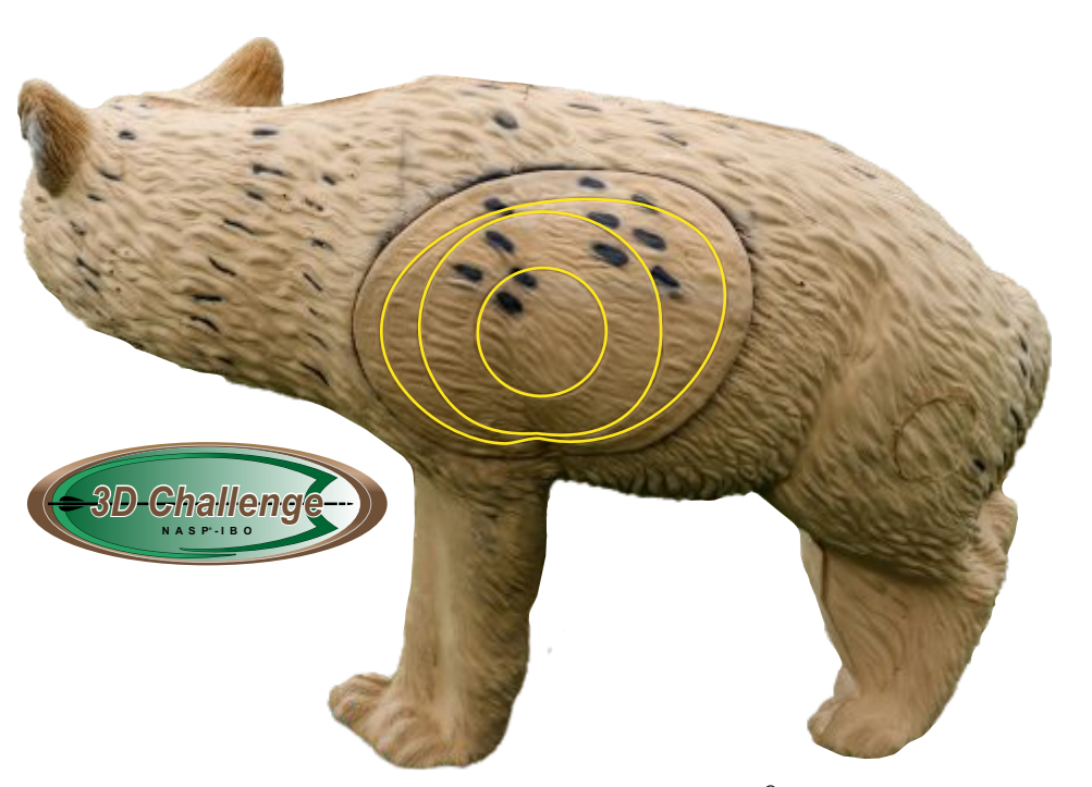
Provided by KY NASP®