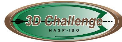
Provided by KY NASP®