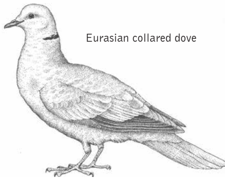
Eurasian collared dove

Possession or use of any lead shot while hunting or attempting to take waterfowl or sandhill cranes is prohibited statewide. Non-toxic shot is required to hunt waterfowl. Most major manufacturers offer non-toxic shotshells. A list of non-toxic shot currently approved by the USFWS can be found at https://go.usa.gov/xSUvE .