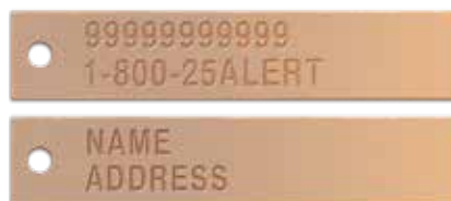
Sample trap tags