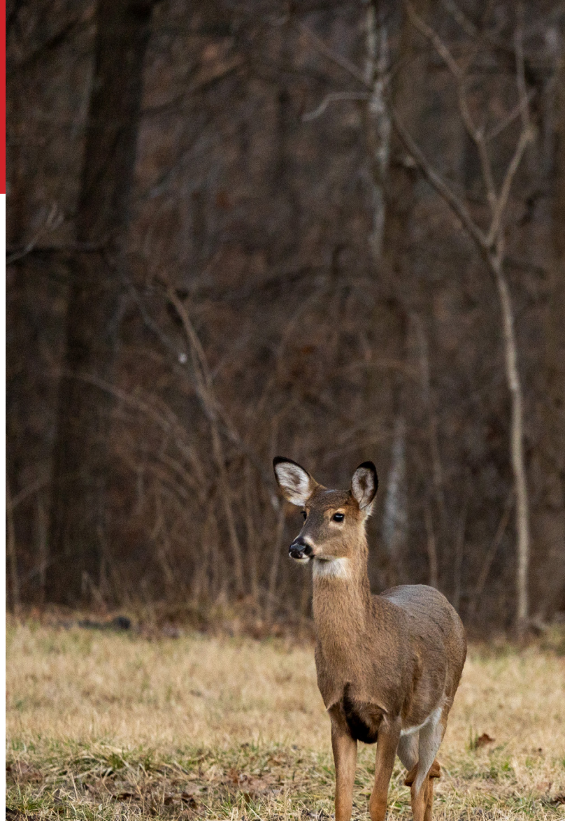
Kentucky Department of Fish and Wildlife Resources Wildlife Regions