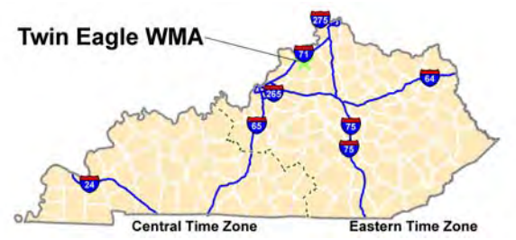
Public Hunting Area Location