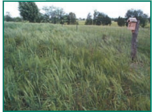
Figure 2. Winter wheat offers excellent winter forage and seed during the summer.

Before planting any specialty wildlife crops, be sure to consider the potential invasiveness of plants.