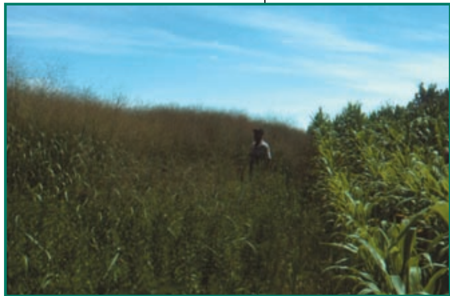
Figure 1. Annual grains should always be planted next to good cover for wildlife. This corn on the edge of a switchgrass field is a good example.