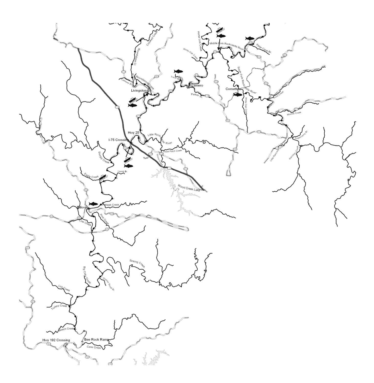
Figure 1. Map of Rockcastle River showing stocking locations and sampling sites. Stocking sites are designated with the fish symbol and access sites used for sampling are indicated with the boat launch symbol.