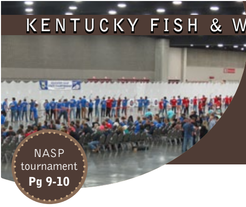
NASP tournament Pg 9-10