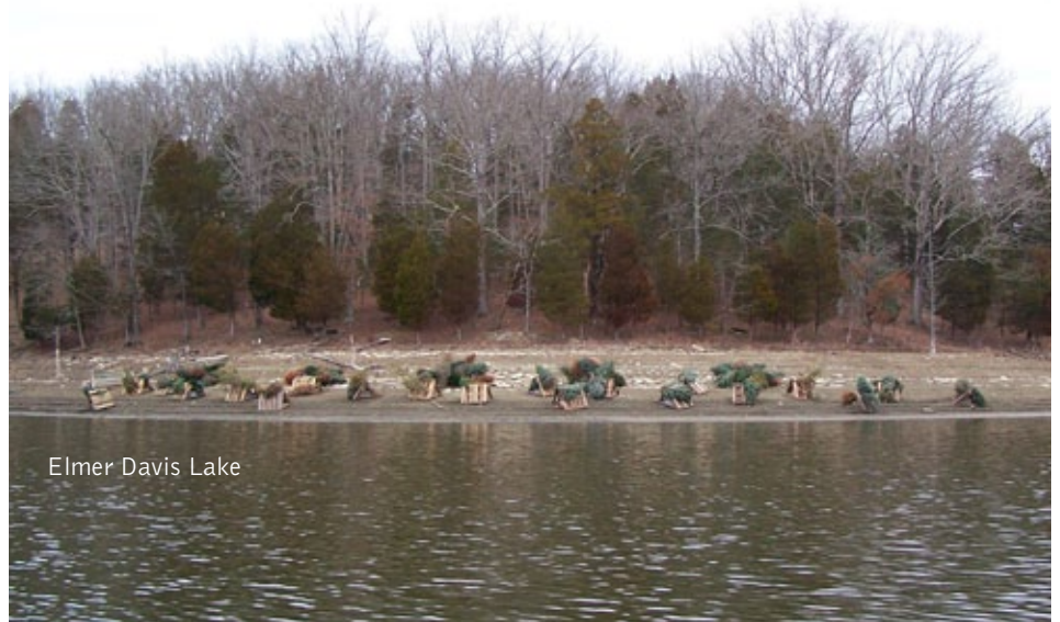
Elmer Davis Lake