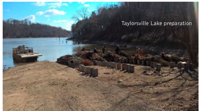
Taylorsville Lake preparation