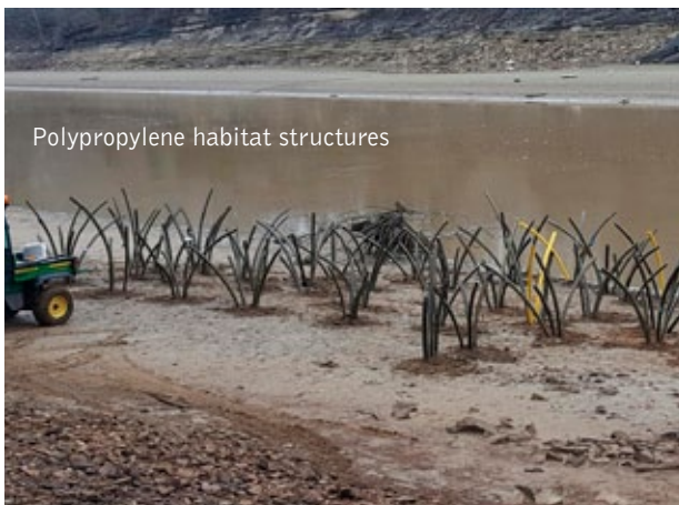
Polypropylene habitat structures