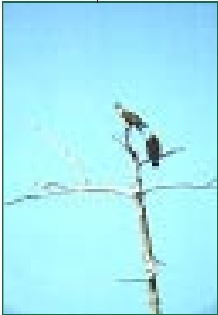
Figure 1. Dead tree tops provide perfect perches for a variety of birds, such as these two immature bald eagles.