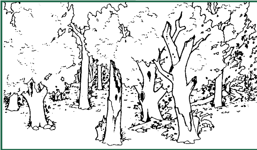
Figure 2. Old, mature to overmature forests with snags and wolf trees are beneficial to a variety of wildlife.

The very best way to maintain these valuable habitat components is to leave naturally occurring snags and den trees alone. This is no problem where timber management is not being implemented. In those situations, the only good reason for cutting down a snag or den tree is when it poses a threat to personal safety or property. However, when timber management is being conducted, maintaining adequate numbers of suitable snags and