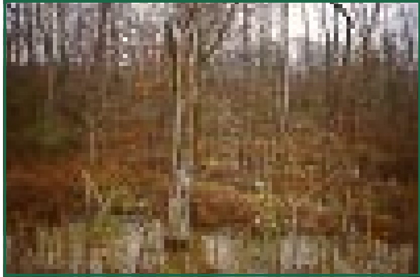
Figure 4. Standing dead trees provide cover and feeding for many mammals, reptiles and amphibians.

Maintain areas of mature forest Protect existing snags and cavity trees of any size Produce snags (and potentially cavity trees) by girdling trees at least 6 inches in diameter