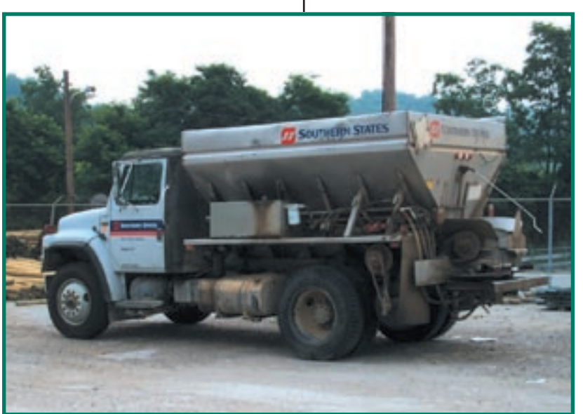
Figure 1. Assistance for applying soil amendments can be obtained from local cooperatives.

tent (often referred to as heavy soils) tend to be very fertile but they are the most difficult soils to till because the small clay particles are easily compacted. Working clay ground when it is too wet will result in cloddy ground or a hard pan (discussed later in section on structure) that is impermeable to water and which has little or no air space between the soil particles. Medium sized soil particles (.02mm - .5mm) are referred to as silts. Silts are powdery when dry and are easily worked. The largest soil particles (.5mm – 2mm) are called sand. Sandy soils are very loose and easily worked