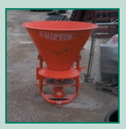
Figure 2. Broadcasting chemical fertilizers is an acceptable application technique.

In some situations, sparse stands of vegetation that might be considered a failure to a production farmer may actually be more desirable to wildlife as habitat.