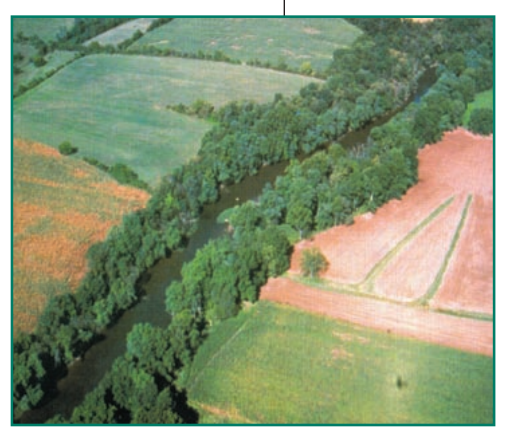
Figure 1. Streamside Management Zone adjacent to pasture and cropland.